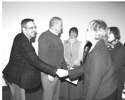
Rensselaer County Legislators greet League members

On the substantive side, we hold several informative meetings each year for the general public on issues -- such as redistricting, solid waste management and health care -- that have long been of concern to our members and the community at large. Finally, our website ( www.lwvrc.org ) contains a wealth of practical and substantive information with links to many governmental sites. (continued on page 4)